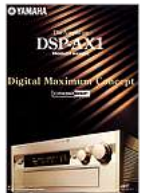
Catalog of that time

Because method of making the sound field which becomes the basis, it changes largely, it recreated also the sound making of cinema DSP entirely from one, don't you think? it is.