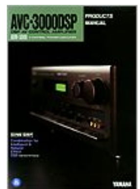
Catalog of that time

As for AVC-3000DSP in completely another design, various function is added, it is. The function and the like which such newly is added, was taken over to AVX-2200DSP, don't you think? it is.