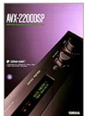
Catalog of that time

Don't you think? that time it is increasing to about 25 ten thousand Yen it is. So, reputation was not bad. At that time, you looked at the movie in the clean picture, it was if, only bought the laser disk. Furthermore so, this (AVX-2200DSP) as for the customer who is bought, generally similar the customer probably will be many, that. If in the laser disk 25 ten thousand Yen the customer who is put out, 22 ten thousand Yen it puts out to AV center, whether it is it is not, that (laughing).