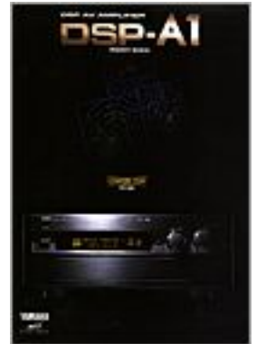
Catalog of that time

Because now, as for the DVD player who does not have the logograph of DTS it is the extent which is not sold, don't you think? truly oh with while saying, it is the spread red sandal wood.