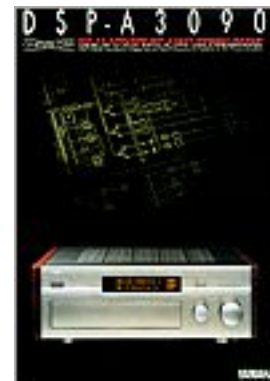
Catalog of that time

Item turn being standardized by DSP from this model, don't you think? the る it is. To tell the truth, AVX-2000DSP for the foreign country was the item turn which starts from DSP, it is. Just domestic item turn hurting the AVX っ て separately, however it does, either it probably will not be good, to divide, don't you think? with the っ lever it is the standardized red sandal wood.